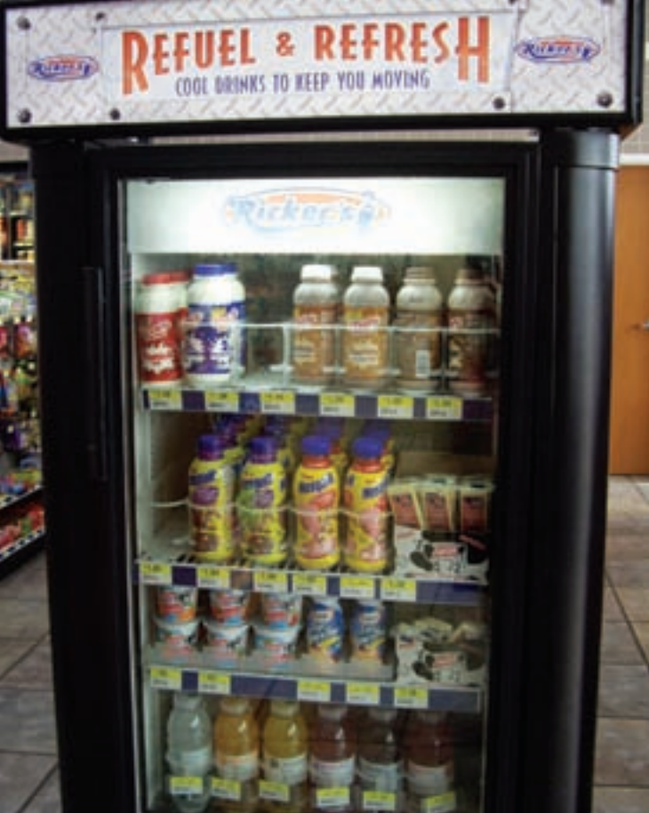
TWICE AS NICE: A secondary cooler dedicated to milk, such as this one at a Ricker's location, has been shown to increase milk sales.

from work, would be more conducive to gallons and larger sizes. Interstate commuter stores mean shoppers who are headed to or from work may want to pick up smaller package sizes. Some retailers, he says, are selling smaller, 8-ounce single-serves to fill the need for consumers seeking lower price points.